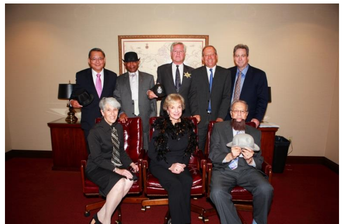
Event Panelists from U.S.D.C. Central District of Calif. & Calif. Court of Appeal